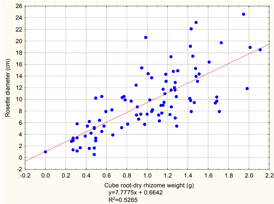
Figure 4. Rosette diameter plotted against the cube root of dry weight of the rhizome.