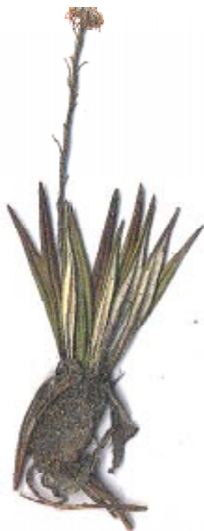
Figure 2. Picture of Oritrophium peruvianum (Asteraceae).

Oritrophium peruvianum (Lam) Cuatr. is a small rhizomatous perennial herb belonging to the Asteraceae family (Figure 2). It grows in the form of a rosette reaching 10-30 cm in height (Badillo, 1994). The leaves have xeromorphic characteristics (small size, heavy cutinization and pubescence at base level) which enable them to adapt to the Páramo environment conditions where they are subjected to intense radiation, low temperature, physiological water stress and strong winds (Torres et al., 1996). Reproduction occurs mainly by seed but vegetative propagation has been assessed during fieldwork and occurs infrequently.